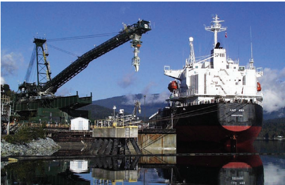
Ships berthed at PCT deliver sulphur to countries around the world.

S upplying the world with sulphur is no easy task. Past issues of Channels have discussed the movement of sulphur from Alberta, through Port Moody, to countries across the globe. It's a job that requires careful timing and excellent communication with suppliers, purchasers, railways, ships, and employees. It's also a job that requires PCT's state-of-the-art facility to work its best to get the job done as safely and as quickly as possible.