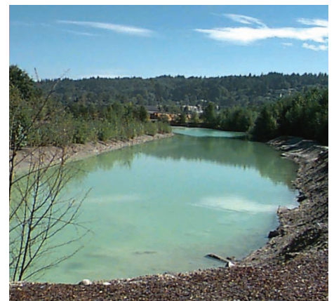
PCT recycles water in ponds like these.

PCT does everything they can to ensure the terminal's impact on the environment is a positive one. That is why PCT is always taking preventative measures and undergoing restoration projects.