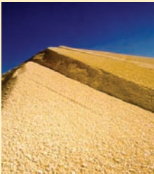
Sometimes steam rises from these piles of sulphur at PCT.

What starts out as a hot liquid cools into warm sulphur pellets. These pellets are then poured into rail cars and transported across the Rocky Mountains from Alberta to Port Moody.