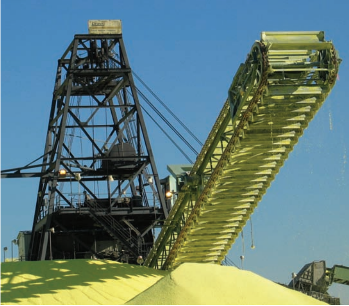
The booms on this stakrake will be replaced as part of PCT's upgrades.

Suppliers in Alberta and customers around the world were also contacted, years in advance, to prepare for these shut downs. Arrangements have been made on a number of fronts. Some customers have stockpiled sulphur in advance or have prepared to simply cut back on receiving shipments. Others will be temporarily receiving shipments from other sources. For example, a portion of PCT's sulphur shipments will be diverted to a terminal located in North Vancouver.