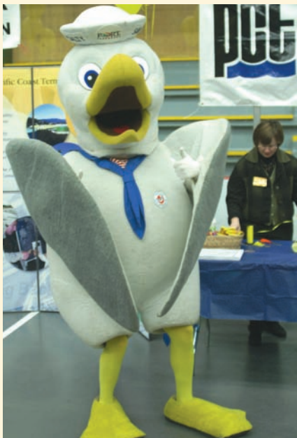
Salty the Seagull was just one of many visitors at this year's Fingerling Festival.

The Canadian Society of Painters in Watercolour had their first showing of work during the Festival of the Arts, at the Port Moody Arts Centre in April. PCT was pleased to have the opportunity to show their support for BC watercolour artists by sponsoring one of the awards at the show.